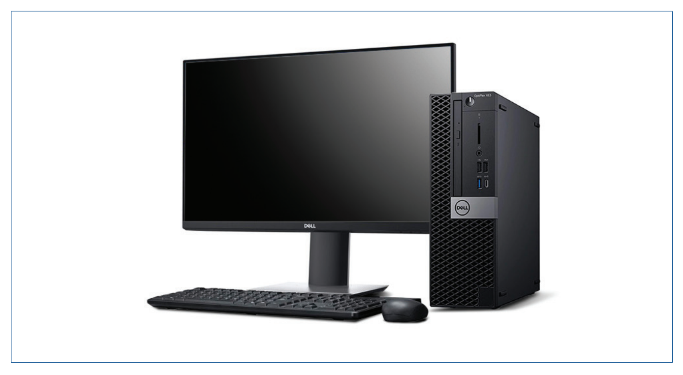
Computers for DeltaV<sup>™</sup> are available to support multiple versions of DeltaV Systems.