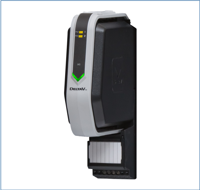
S-series H1 Fieldbus I/O Interface Card.

The Fieldbus I/O Card meets ISA G3 corrosion specifications by using superior electronic components and conformal coating.