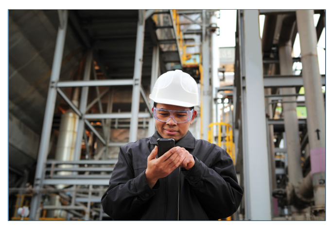
AMS Device Manager Data Collector provides users the ability to stay in touch with the health of instruments and valves from anywhere, including their mobile phones.