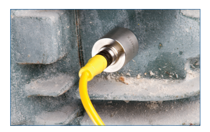
The triaxial accelerometer allows for the collection of vertical, horizontal and axial data from the same location simultaneously.

Is the source of vibration coming from the motor you are measuring, or is the vibration coming from another source — maybe the motor to your right? With the four-channel option, you can perform a coherence measurement immediately with the four sensors rather than moving the analyzer sensors from one machine to another and making consecutive measurements.