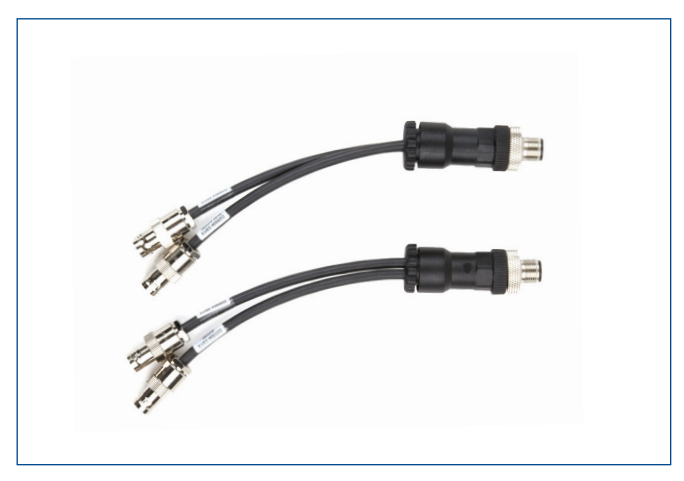
Splitter cables included in the four-channel accessory kit are another way to collect four-channel simultaneous measurements.

Emerson Reliability Solutions 835 Innovation Drive Knoxville, TN 37932 USA