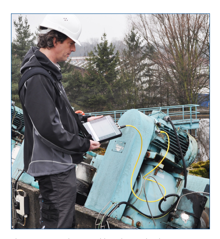
The AMS 2140 Machinery Health Analyzer makes data collection and advanced analysis easier and more efficient.