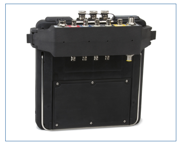
The four-channel adapter snaps easily to either side of the analyzer itself. The padded shoulder strap attaches to the outside of the adapter.

The four-channel accessories kit includes everything you need to unlock the power of the AMS 2140 four-channel analyzer. Simultaneously collect four-channel acceleration data for rolling element bearings, or four-channel volts data for sleeve bearings from a single input adapter by simply turning it over and using the appropriate side. The adapter is simple to install with a simple tab-click installation on both sides of the analyzer. The kit includes the 4-channel input adapter, cables, accelerometers, and magnets necessary to perform most any kind of 4-channel analysis.