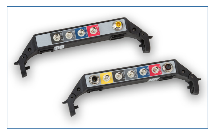
The adapter offers accelerometer inputs on one side, volts inputs on the other.