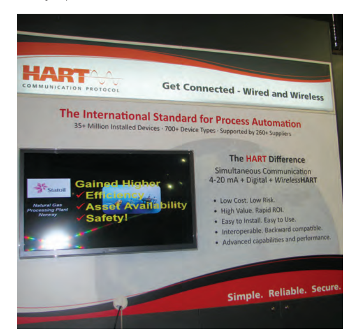
WirelessHart transmitters make it economical and low risk to deploy essential asset monitoring packages in a running plant.

The WirelessHart standard meets diverse user needs such as multi-vendor interoperability, transparent integration, simple commissioning, reliability, statistics and diagnostics, security, realtime determinism, long battery life, interchangeability, coexistence, lifecycle version management, familiar tools, and independent third-party certification.