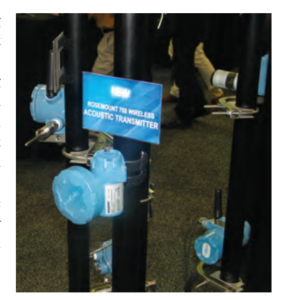
In steam trap monitoring, a wireless acoustic transmitter 'listens' for ultrasonic noise created by steam or condensate, and also measures the temperature at the steam trap inlet via a built-in sensor.

The only practical approach then is to automatically monitor the pump and motor assembly. The new solution measures a number of points on the pump: