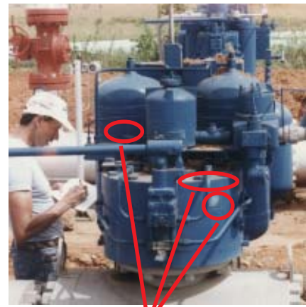
Serial tag or stamping location

A helpful tip when trying to see serial numbers on aged equipment is to scratch off the paint that may be covering the number. Once the number is visible, take a black marker and mark over the number then immediately wipe it off before it dries. Any indentation made when the serial number was stamped will be visible.