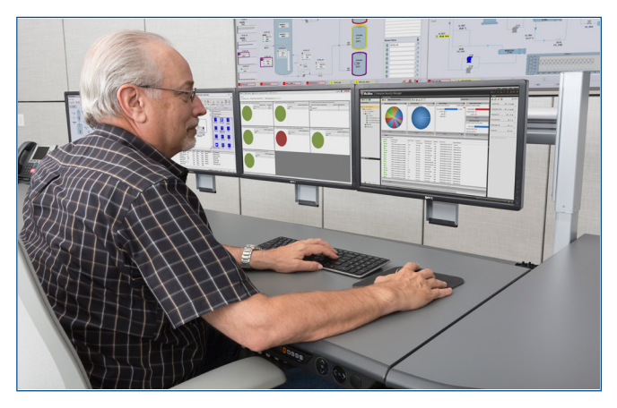
Application Whitelisting for DeltaV<sup>™</sup> Systems allows for whitelisting applications as an integral part of the threat defense lifecycle.