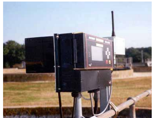
MSL600 mounted over the settlement tank