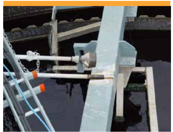
Fig 3 MSL602 transducer tilted out of the supernatant

For this application at Ineos, the scraper passes by the MSL600 every 13 minutes, so the function of holding the last good value on the 4-20mA outputs is vital for their measurement.