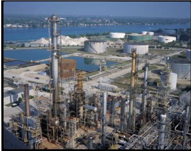
Large or geographically dispersed systems can benefit from the DeltaV Zones Architecture.

This new flexibility can provide better plant-wide control by providing the ability to access key information that was previously unavailable or too costly/difficult to implement.