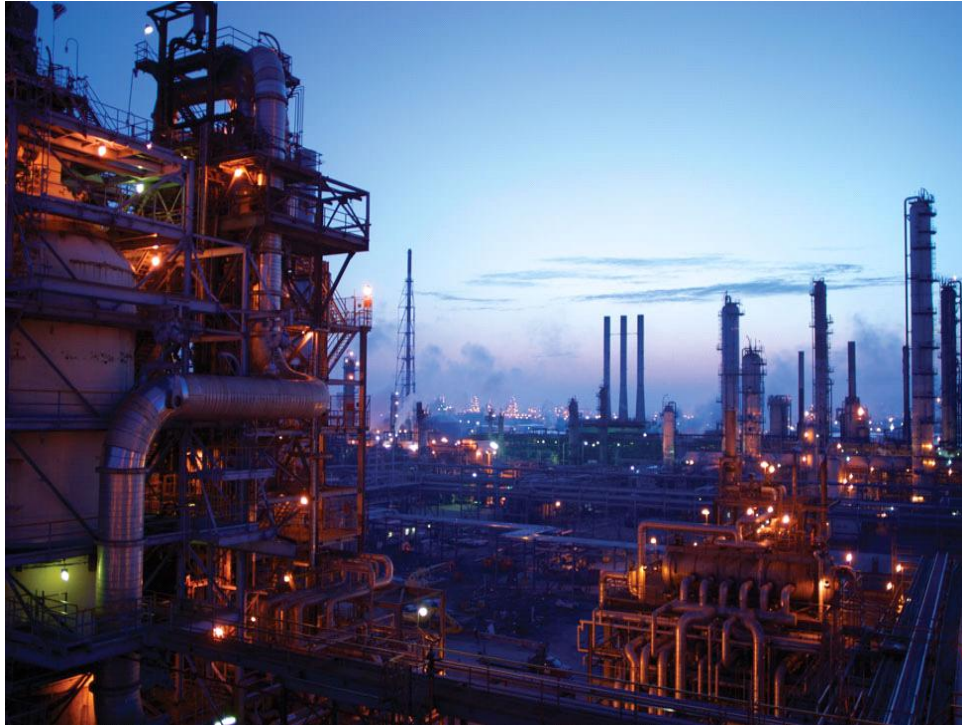
Multiple standalone DeltaV systems can now be connected via an Inter-Zone Network to provide unprecedented view and control of your entire plant.