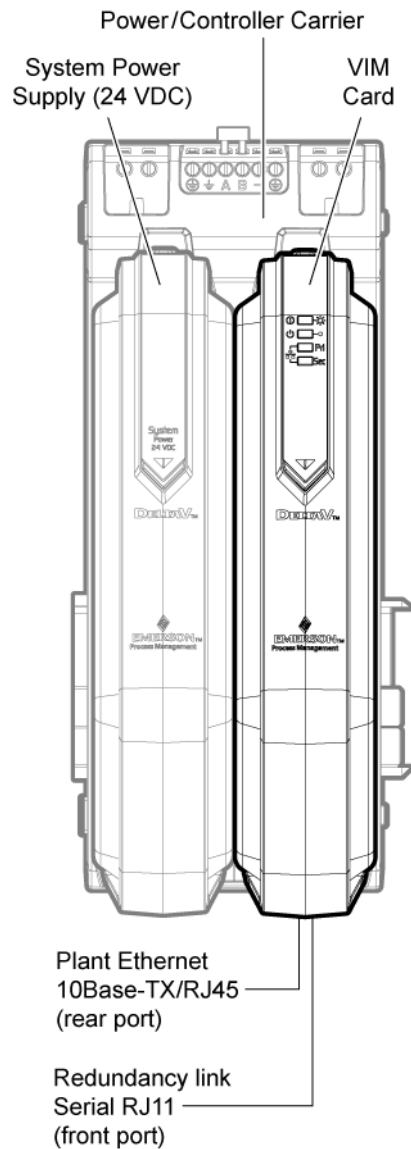
S-Series VIM and power supply details