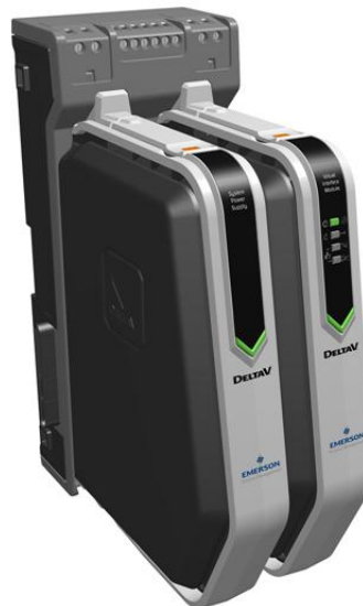
S-Series VIM and power supply

Modular, flexible packaging. The VIM mounts in the same manner as the DeltaV controller. It mounts in the controller slot of a DeltaV 2-wide horizontal or 4-wide vertical carrier and uses a standard DeltaV Power Supply. The advanced design of the VIM will provide years of uninterrupted use.