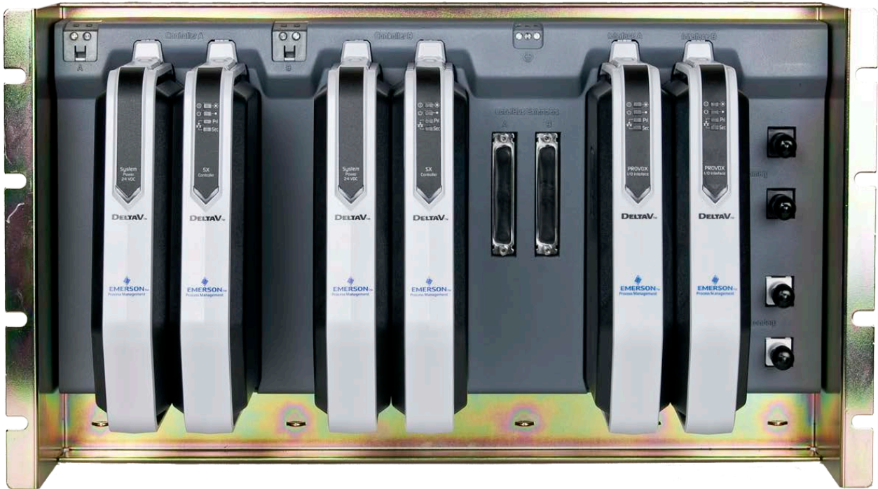
The S-Series DeltaV Controller Interface for PROVOX I/O.