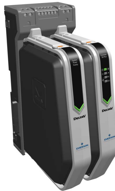
The SD Plus Controller

Field Proven Architecture. The S-Series controllers are an evolution of DeltaV M-Series hardware. The new design delivers installation and robustness enhancement while still using the same processor and OS that has proven itself in the field. All S-series I/O cards run the latest software enhancements of corresponding M-Series I/O cards and deliver the same field proven, reliable operation.