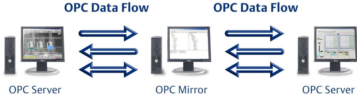
Data transfer between OPC servers is easy with OPC Mirror