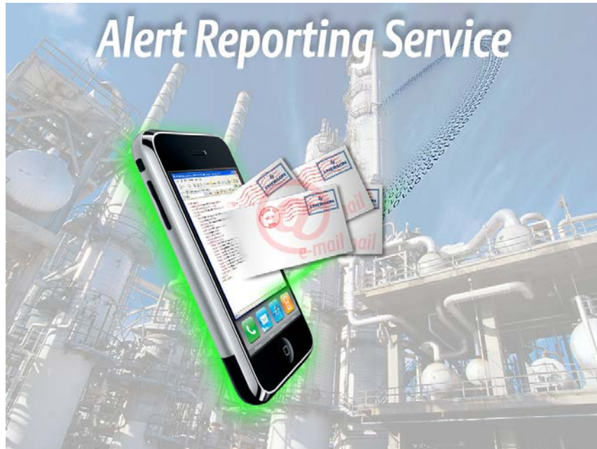
Plant Messenger delivers DeltaV™ alarms and events anywhere in the world.