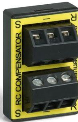
RC Compensator Module