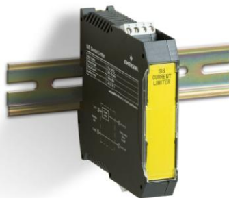
SIS Current Limiter