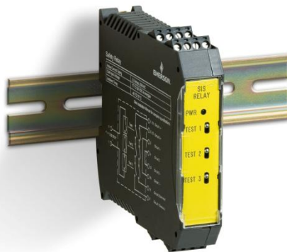
SIS Relay Module