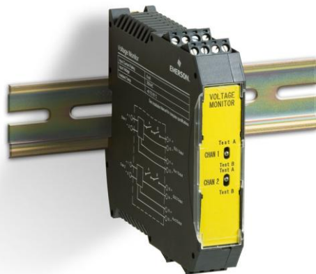
SIS Voltage Monitor