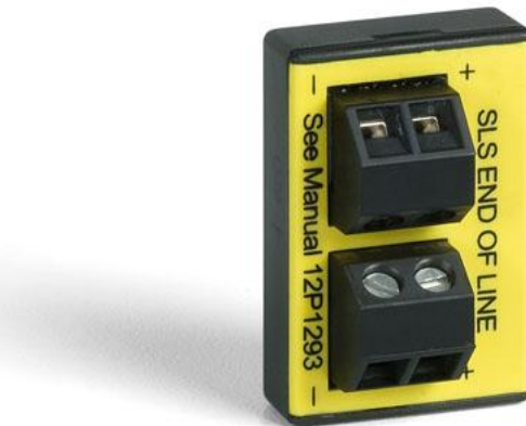
End of Line Resistance Module