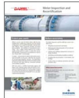
Meter Inspection and Recertification