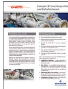
Compact Prover Inspection and Refurbishment