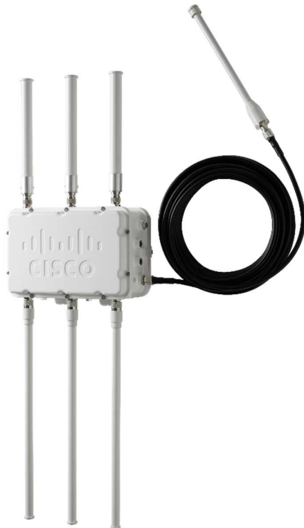
1552WU with Wi-Fi omni antennas and remote mounted WirelessHART omni antenna