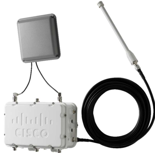
1552WU with 5 GHz Wi-Fi patch antenna and remote mounted WirelessHART omni antenna