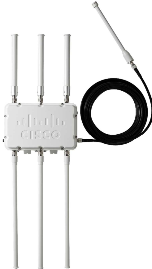
Smart Wireless Gateway 1552WU