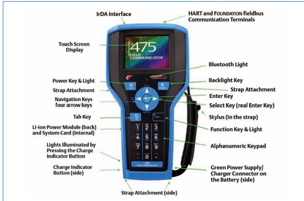
The 475 Field Communicator user interface is explained in the technical training.