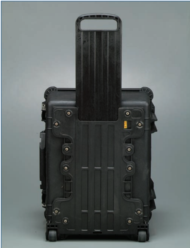
The CSI 2600 was designed for travel. It comes with a special rugged and durable travel case

Emerson Process Management Asset Optimization 835 Innovation Drive Knoxville, TN 37932 T (865) 675-2400 F (865) 218-1401 www.EmersonProcess.com