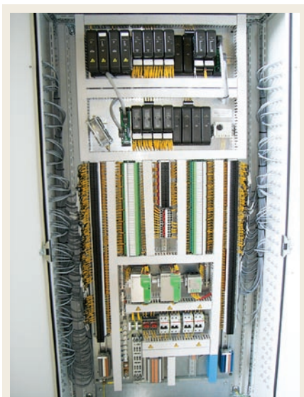
Fig. 2. The control package was integrated in the HPU package and underwent factory acceptance testing before being shipped.

A typical automation cabinet prepared for installation in a package unit is shown in Fig. 2. In this case, the control package was integrated in the HPU package and subjected to complete factory acceptance testing in Nordfjord, Norway, before it could be shipped to the Singapore yard. The cabinets for the Kanfa process modules were certified in the Netherlands for placement in Zone-2 applications. In addition, the whole project, including the control system architecture, power and grounding, was certified by Det Norsk Veritas (DNV).