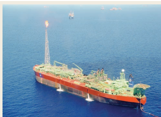
Fig. 1. The new FPSO, Yuum K'ak' Naab, or Lord of the Seas in Mayan, was commissioned in late 2006 with first oil in late June 2007 and first offloads in early July 2007.

Still, procurement of field instruments for some packages had progressed beyond the point-of-no-return, which prevented the bus systems from being implemented throughout