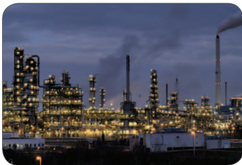
The Total Refinery, Spergau, Germany, uses intelligent valve controllers and asset management software in critical units.

ginning in the late 1990s. However, Gordon also had the Fisher DVCs installed on several older, non-Fisher control valves that were still viable at the time. “In instances where we have installed a DVC on an older valve, my experience is that it makes a bad valve work better until a replacement can be installed. The nice thing is that we not only succeeded in deferring a capital expense this way, but when we decide the time is right to replace the older valve, we can also transfer the DVC from the older valve to the new valve assembly.”