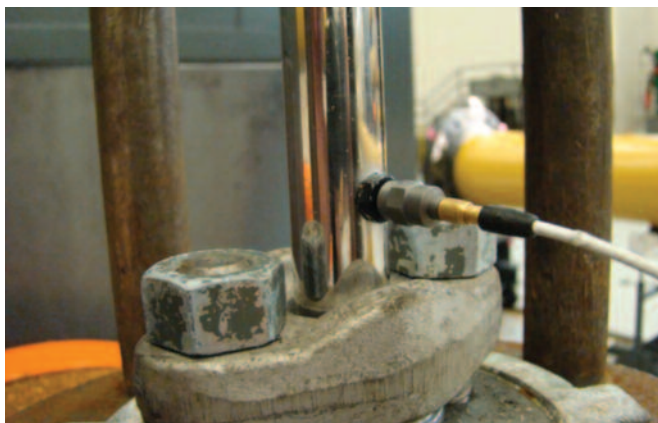
Typical mounting of accelerometer to valve stem.

The problem was exacerbated recently, when the ISOMAX unit began to generate noise that propagated beyond the refinery property line. In fact, the refinery received complaints from nearby