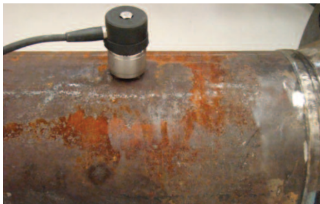
Magnetic mounting of an accelerometer to a pipe wall.