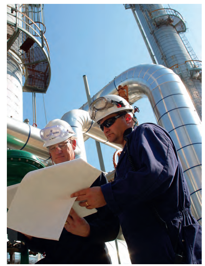
Quality-based review process – Emerson meter inspection

Inspection or audit is one aspect of monitoring the measurement system and is a quality-based review process. It is used to identify nonconformances and areas for improvement. While there is a great deal of information and standards available on the process of auditing, there are very few standards or guidance notes that can be applied directly to complete upstream oil and gas measurement systems. HM 60 [4] could be considered one reference document but this primarily focuses on the audit process, not the measurement critical content of the review. In most cases the method and procedures have to be constructed by an experienced, competent person from a combination of standards, guidance notes, regulations, commercial agreements and "good oil-