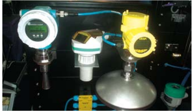
Interoperability between a broad array of fieldbus products from different manufacturers has improved greatly thanks to ever more rigorous testing of devices and systems.

One thing we learned from the fieldbus standardization effort is that industry consortia like the HART Communication Foundation,