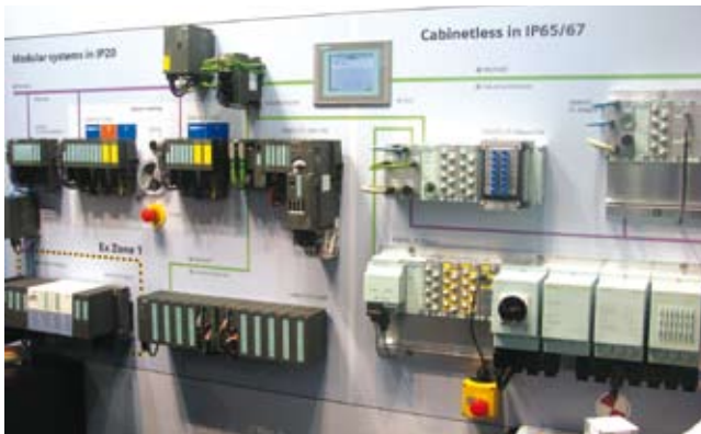
Rather than competing as was initially envisaged, fieldbus and Ethernet networks complement each other in today's plants.

A wireless field network is pure digital communication which can be used where running a bus to instruments is costly or impractical. Just as for bus technologies, there are different ways to do wireless depending on the requirements to be met.