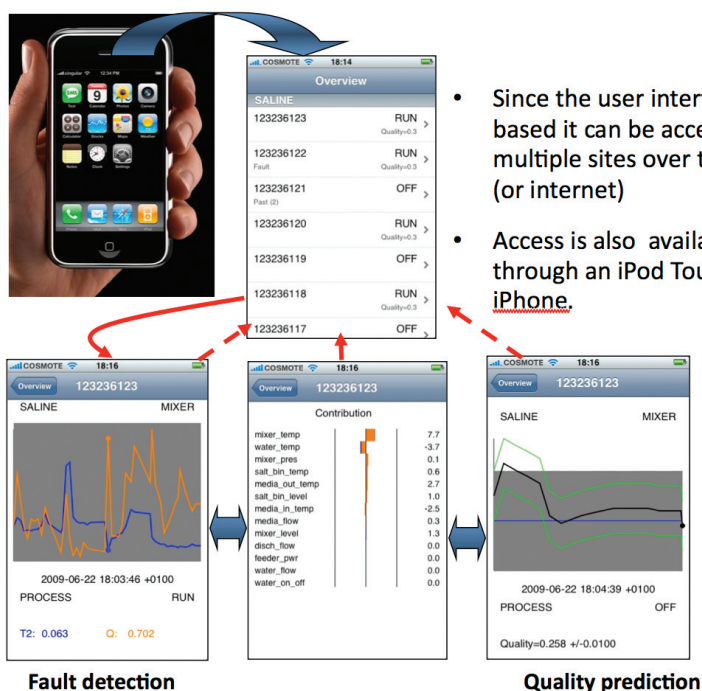
Fig. 7 — iPhone and iPod use for web-based analytics user interface

Robert Wojewodka, Terry Blevins, and Willy Wojsznis